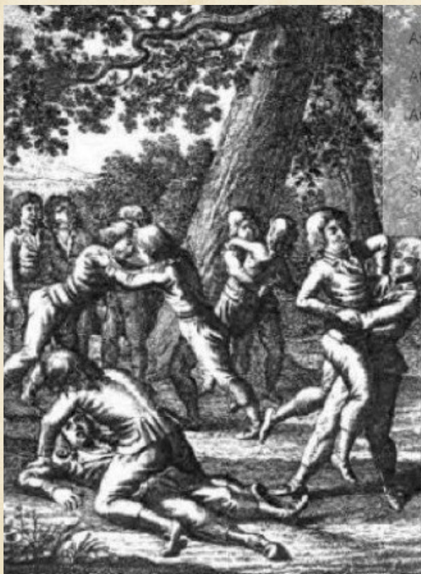
German Folk Wrestling

Other famous wrestling authors of that era included: