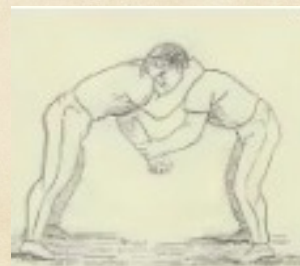
The Referees Hold